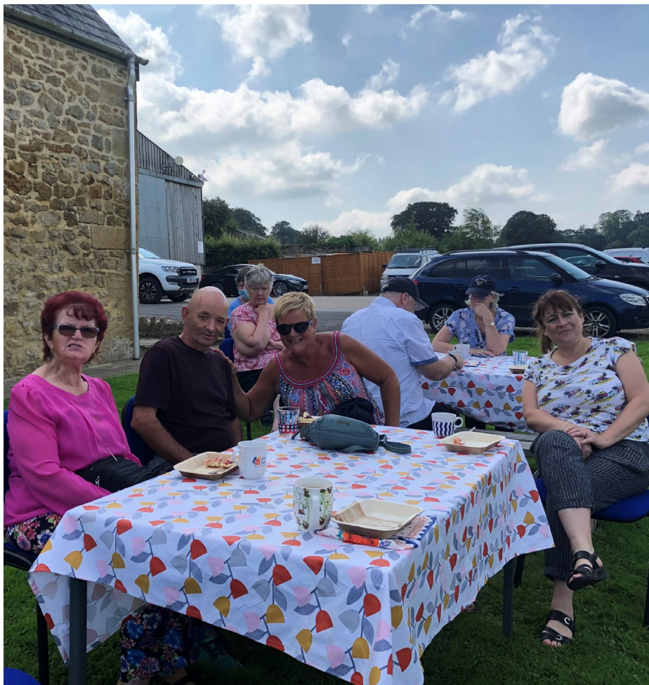
The Somerset team hosted a cream tea event for SLSW Carers recently to come together within in the office grounds. It was the first time many of the carers had come together since the pandemic. We hope everyone who attended had a great time.