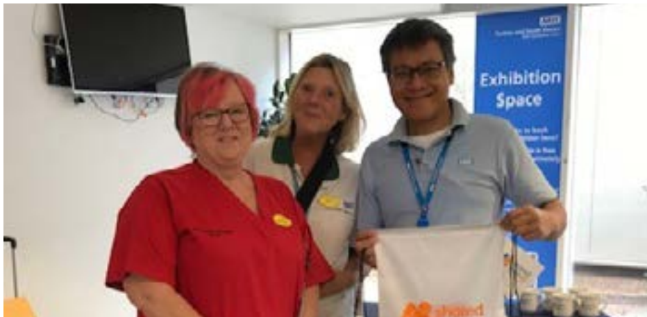
We had a stand at Torbay Hospital and met so many wonderful healthcare professionals, carers and patients. Thanks for hosting us - hopefully we'll be back for more!