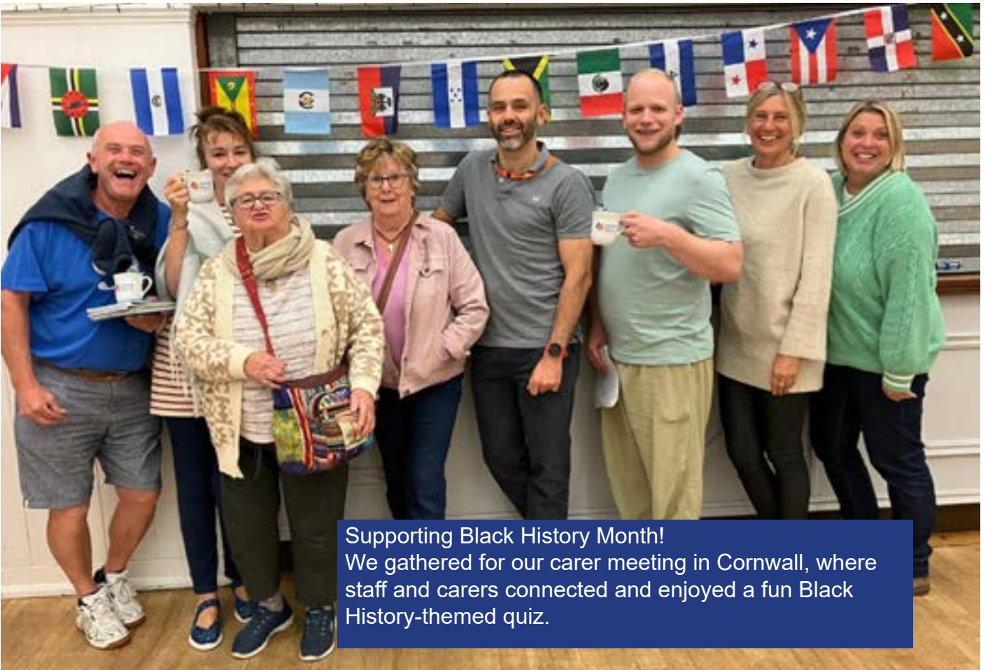
Supporting Black History Month! We gathered for our carer meeting in Cornwall, where staff and carers connected and enjoyed a fun Black History-themed quiz.