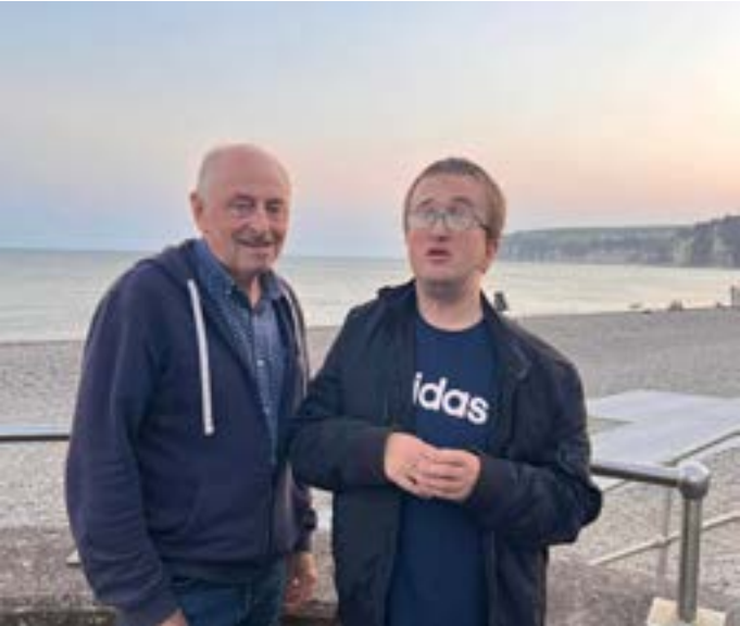
Making the most of the last of summer sun! Fish and chips, and walking the seafront. What could be better?