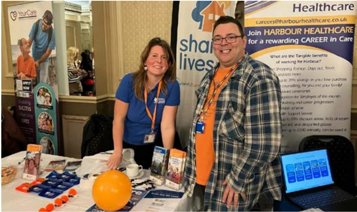
We attended the careers showcase in health and social care with Plymouth Caring at the Duke of Cornwall Hote in the city..